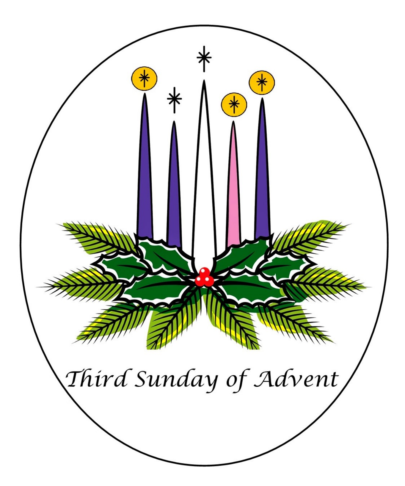
Lake Toxanvay United Methodist Church Sunday, December 12<sup>th</sup> 2021